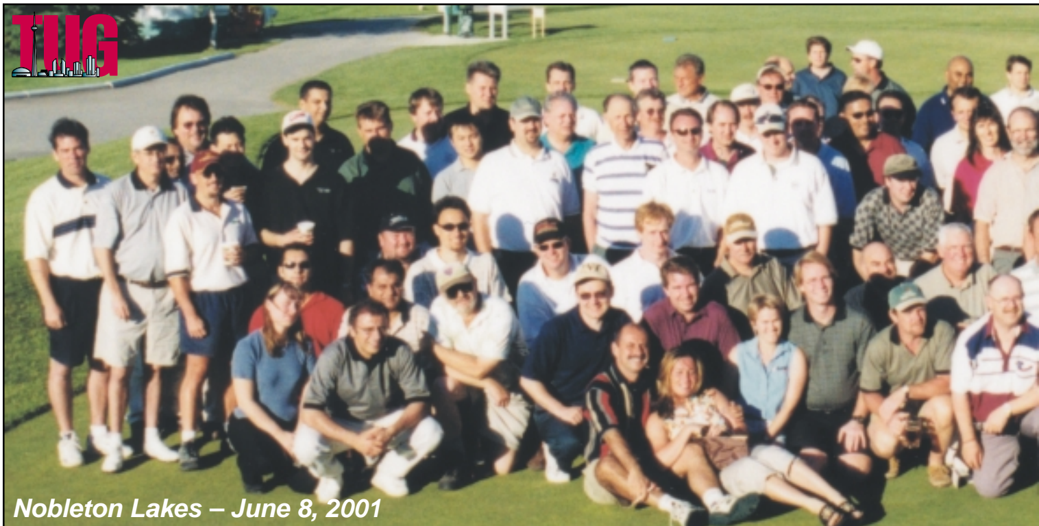
Nobleton Lakes – June 8, 2001