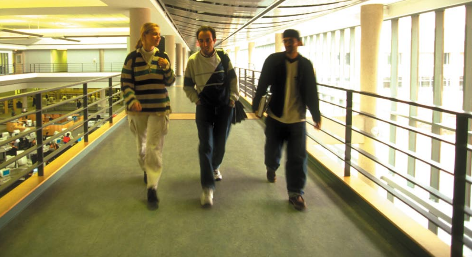
Seneca students striding towards the future