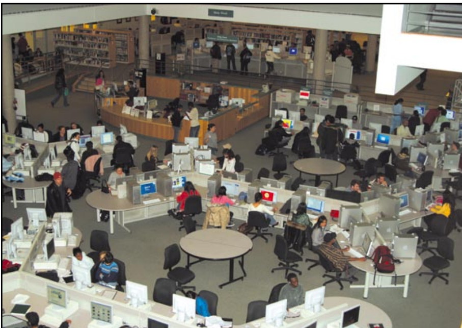
The library at Seneca College (Seneca@York campus)