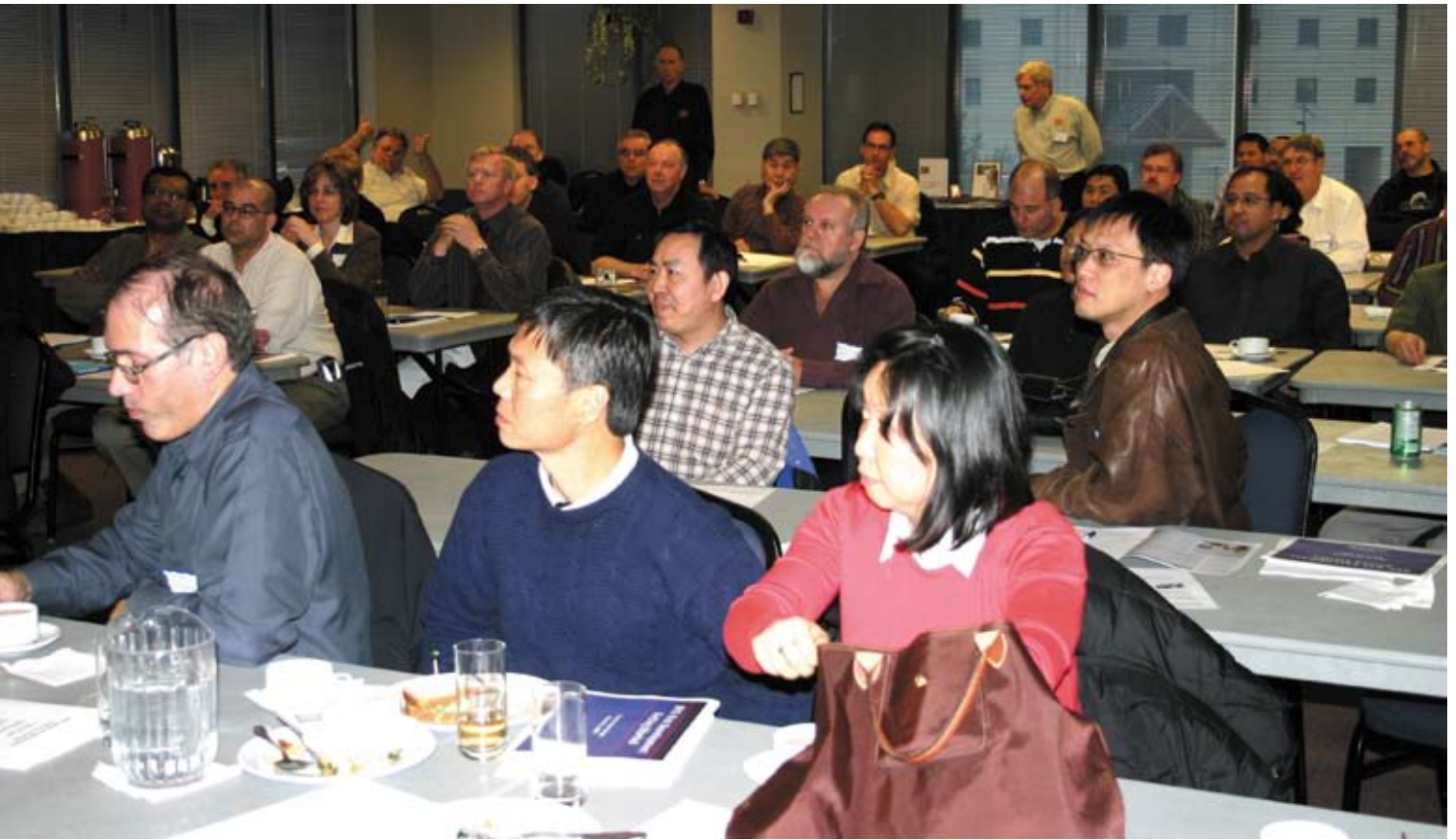
Above and previous page-bottom: TUG members at the March 21st Meeting of Members, Living Arts Centre Mississauga