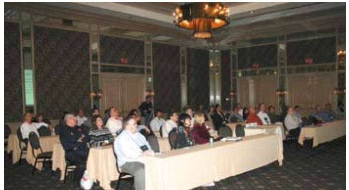
Tuesday 5:30 PM session: "It's All in Your Mind"