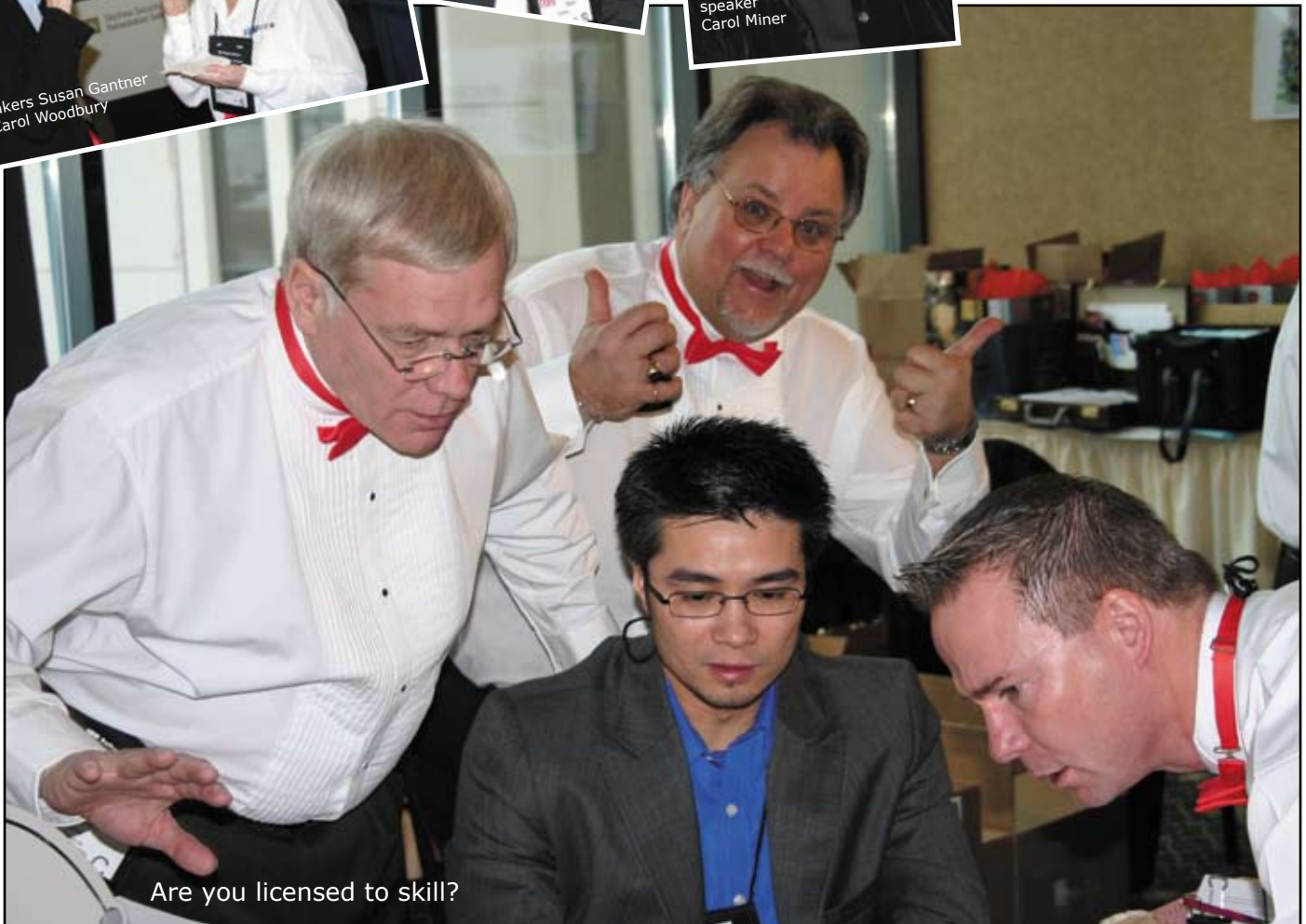
Are you licensed to skill?