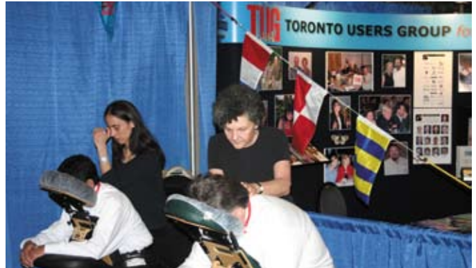
The fabulous massage chairs (by Rhoda Caplan and associate)