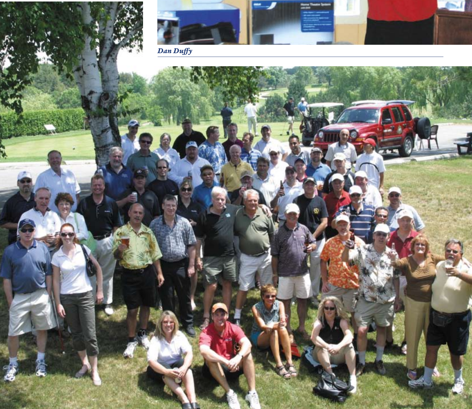
TUG's 19th Annual Golf Tournament at Glen Eagle Golf Club in Bolton, June 21, 2007