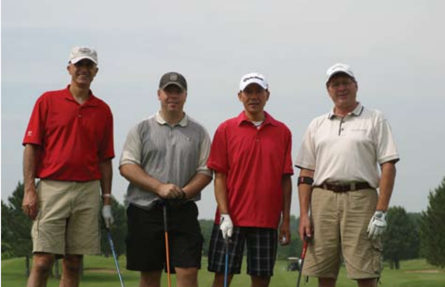
2008 Tournament Champions