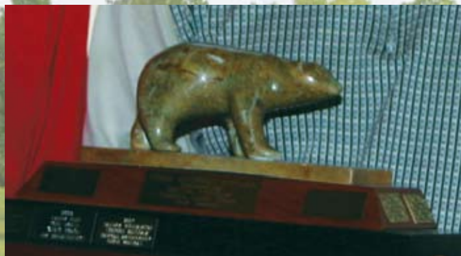
The Gord Jackson Memorial Award

It is never enough to thank the sponsors for an event that is not for profit, but yet to generate a donation to a worthy cause, while having some fun doing it. This year we had Able-One Systems Inc. , Aon , Canon , Dynamic DR , End to End Networks , IBM , Mid-Range , Rogers , and Syntax.net . Some of these sponsors provided valuable gifts to the prize table as well. We would also like to thank Ganz , and Kuehne & Nagel for supporting this event by sending 8 players from each company to the tournament.