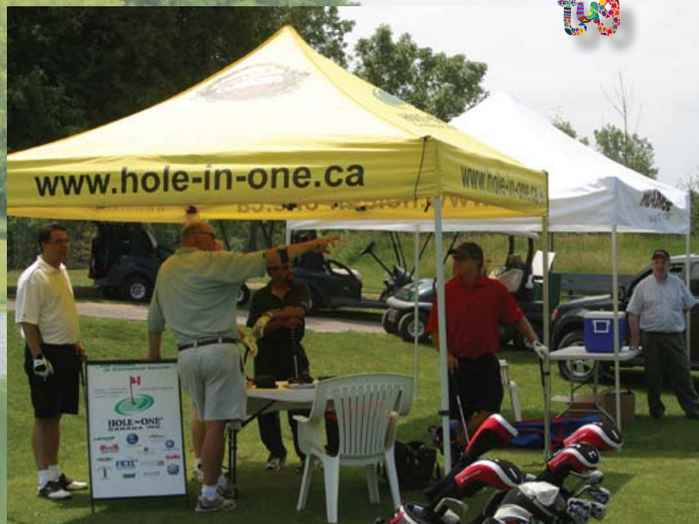
Hole-in-one / Closest to the Pin Competition sponsored by Mid-Range