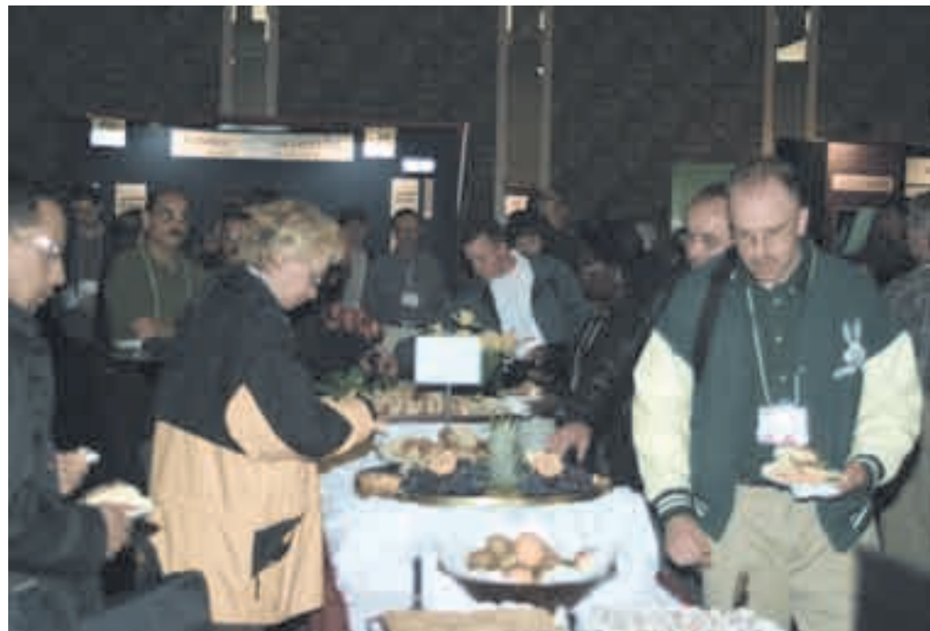
Hungry attendees sample the complimentary buffet during Showcase 2003

The Vendor Showcase will open at lunchtime. I find this part of the