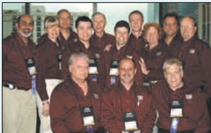
TEC 2004 committee members

The Vendor Showcase was great this year. We had 33 vendors composed of our faithful regular sponsors plus quite a few new ones! (See sidebar for the list.) It was exciting to see all of the latest information on iSeries related products and services laid out for us, plus the hors d'oeuvres and the fabulous vendor-donated door prizes. A big thank you to all of the vendors for putting on such a super Showcase! A special thanks