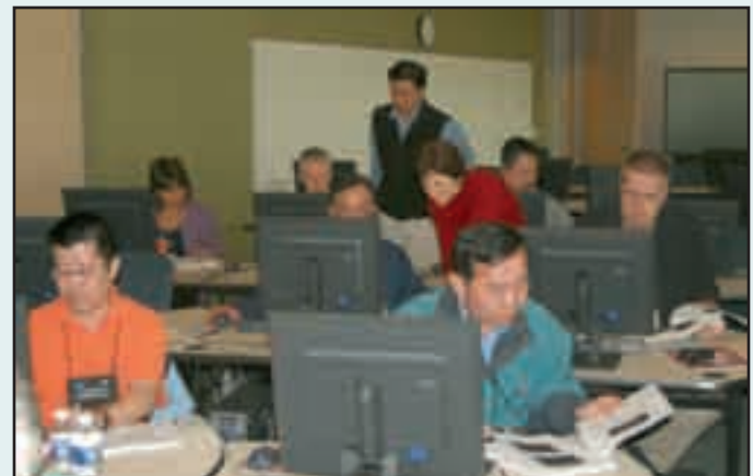
Remote sessions at the IBM Canada Lab