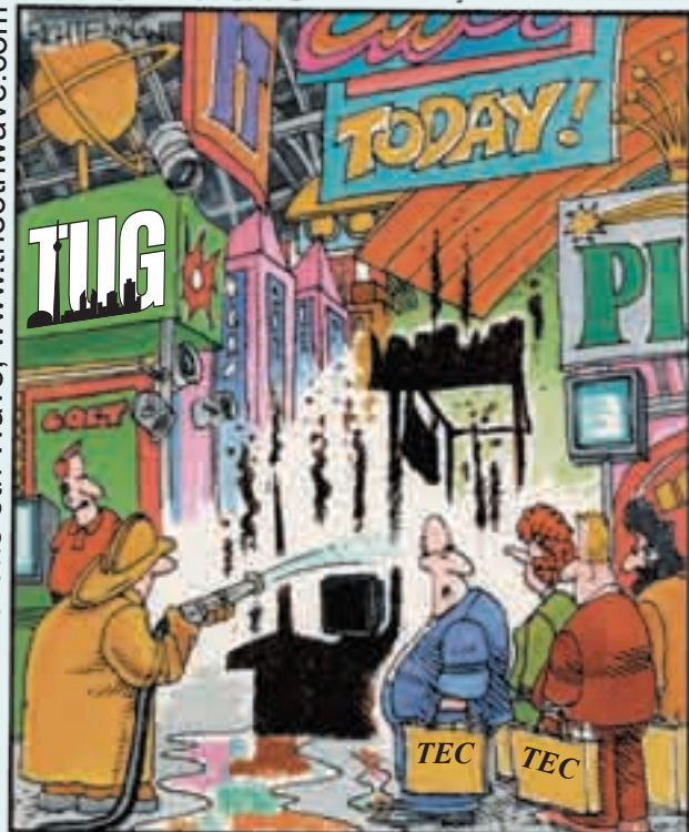
"I saw the flames when they started too. I just thought it was part of the exhibit."