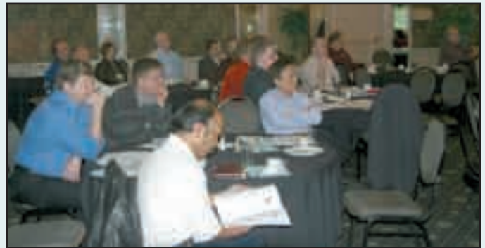
Attendees at the executive breakfast sessions

Afterwards, the executives were invited to visit our Vendor Showcase. An open invitation was issued to attend any of the regular sessions so they could fully appreciate where (and why) their education dollars were being spent."