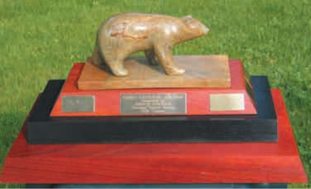
The Gord Jackson Award