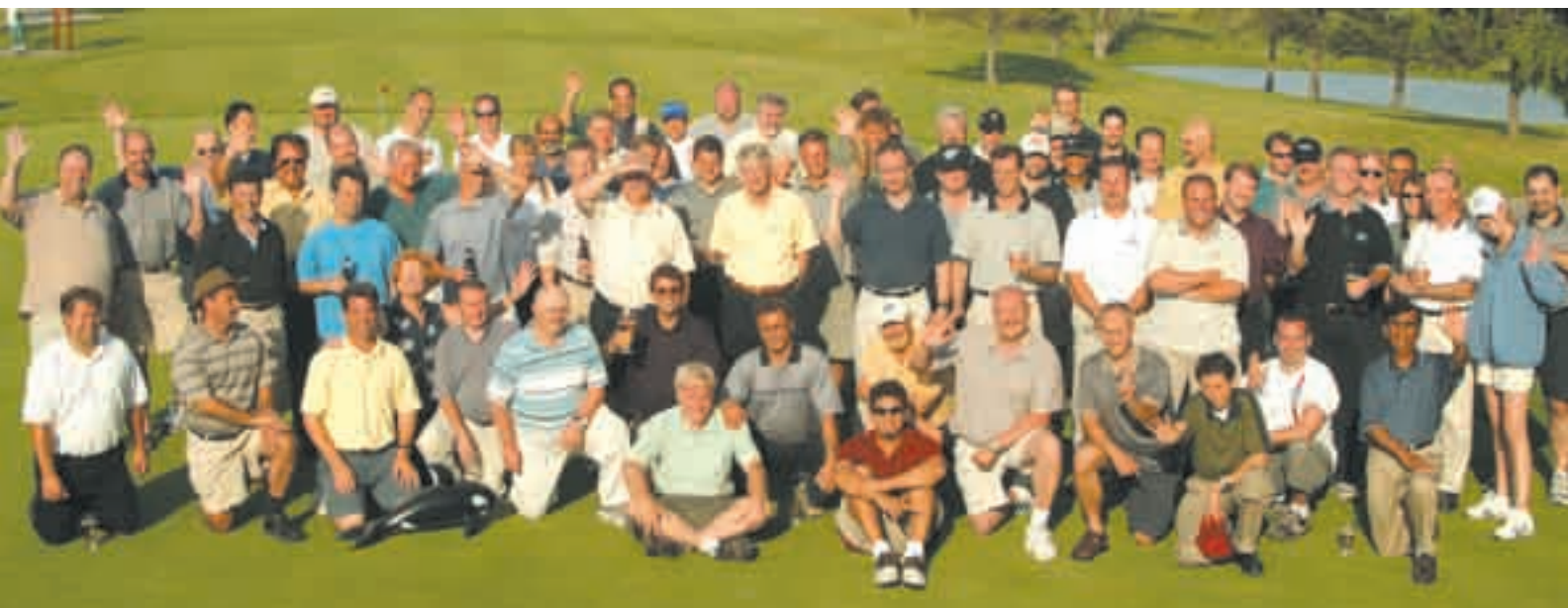
The 16th annual TUG Golf Classic tournament and banquet – June 18, 2004, Nobleton Lakes, Ontario