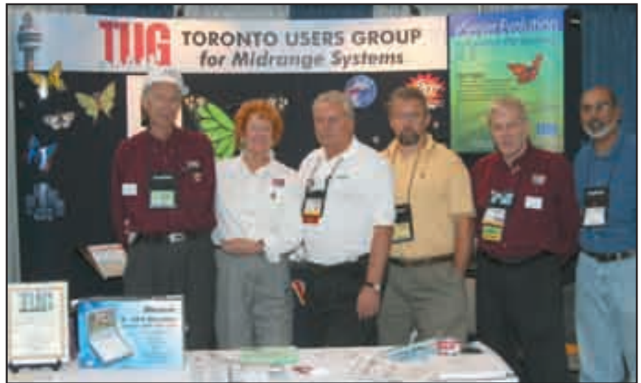
Volunteers at the TUG / LUG table welcomed visitors to Toronto

In actuality, it started earlier with visiting the www.common.org website and reviewing the online session guide. The theme of this conference was Enterprise Application Modernization. I was overwhelmed with the variety of Courses of Study (COS) offered at the conference. From technical bits & bytes to professional development there were more sessions I wanted to attend than there was available time. With each COS, there is a focused roadmap that assists in choosing the necessary sessions that are related; as these sessions are scheduled to avoid timing conflicts for the attendees.