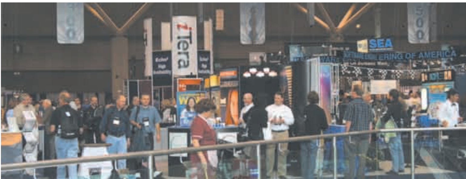
Over 100 midrange exhibitors were on display at the COMMON Expo

system to have the POWER5 processor chip. This is also the forum where attendees have a chance to pose their questions to the IBM iSeries Executives. I was impressed by the candid responses to the questions that were asked. With the conclusion of the meeting, I visited the Expo and enjoyed the food at the reception. Sunday's publication of the CCD stated it is the "World's Largest iSeries-Related Expo". It was a great opportunity to meet with vendors and learn about their products. Talking to suppliers of some of the products used in our shop was an added benefit in strengthening a business relationship.