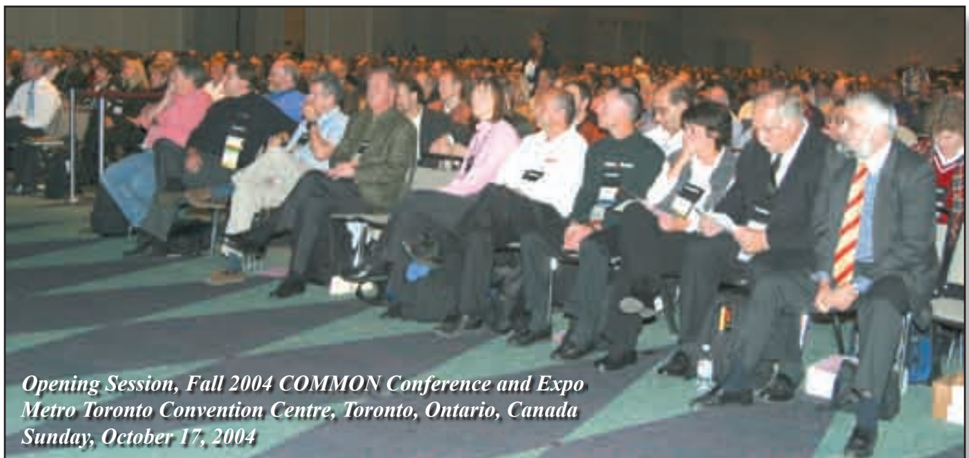
Opening Session, Fall 2004 COMMON Conference and Expo Metro Toronto Convention Centre, Toronto, Ontario, Canada Sunday, October 17, 2004