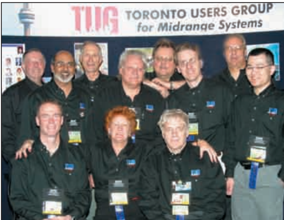
TEC 2005 Committee