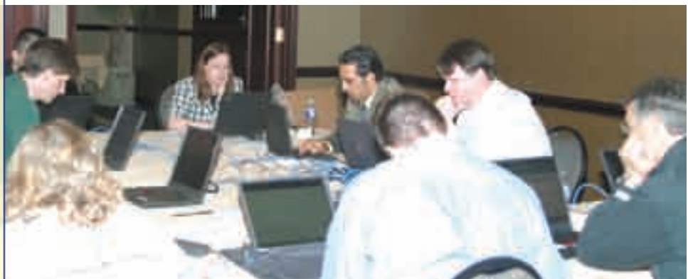
Attendees writing their certification exams