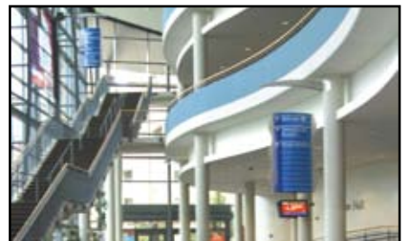
Living Arts Centre Mississauga

different User Interface, Services, and Data Sources; which include DB2, WebSphere and the iSeries. A high level .NET Roadmap preceded Charles’ continuation of the session. Charles showed examples of three businesses that used .NET to develop revamped delivery of User interaction where