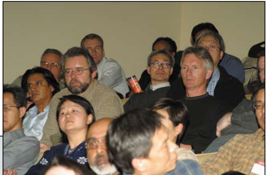
The Mississauga venue attracted many first-timers