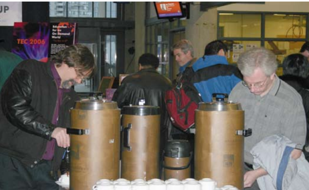
TUG MoM Intermission at the Living Arts Centre in Mississauga