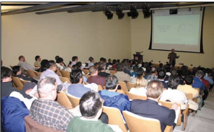
TUG Meeting of Members — January 18, 2006