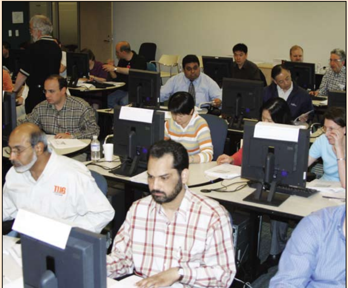
Day 3 features hands-on lab sessions at the IBM Toronto Lab