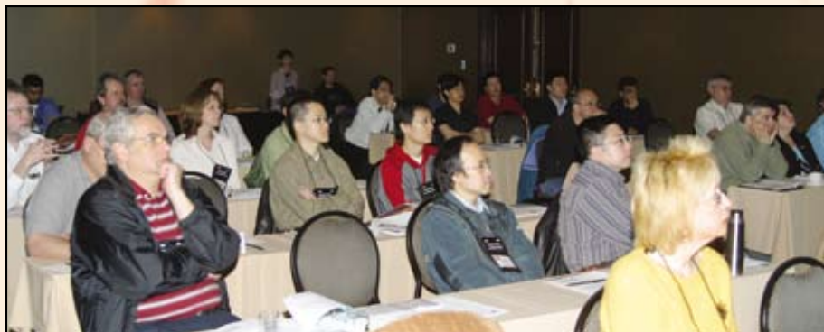
TEC always has multiple tracks of lecture sessions over two full days